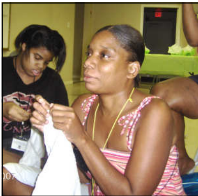
Stitches Of Hope