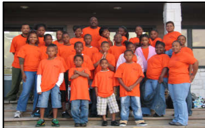
Overcoming Obstacles Challenge Camp 2007 participants, staff and volunteers.